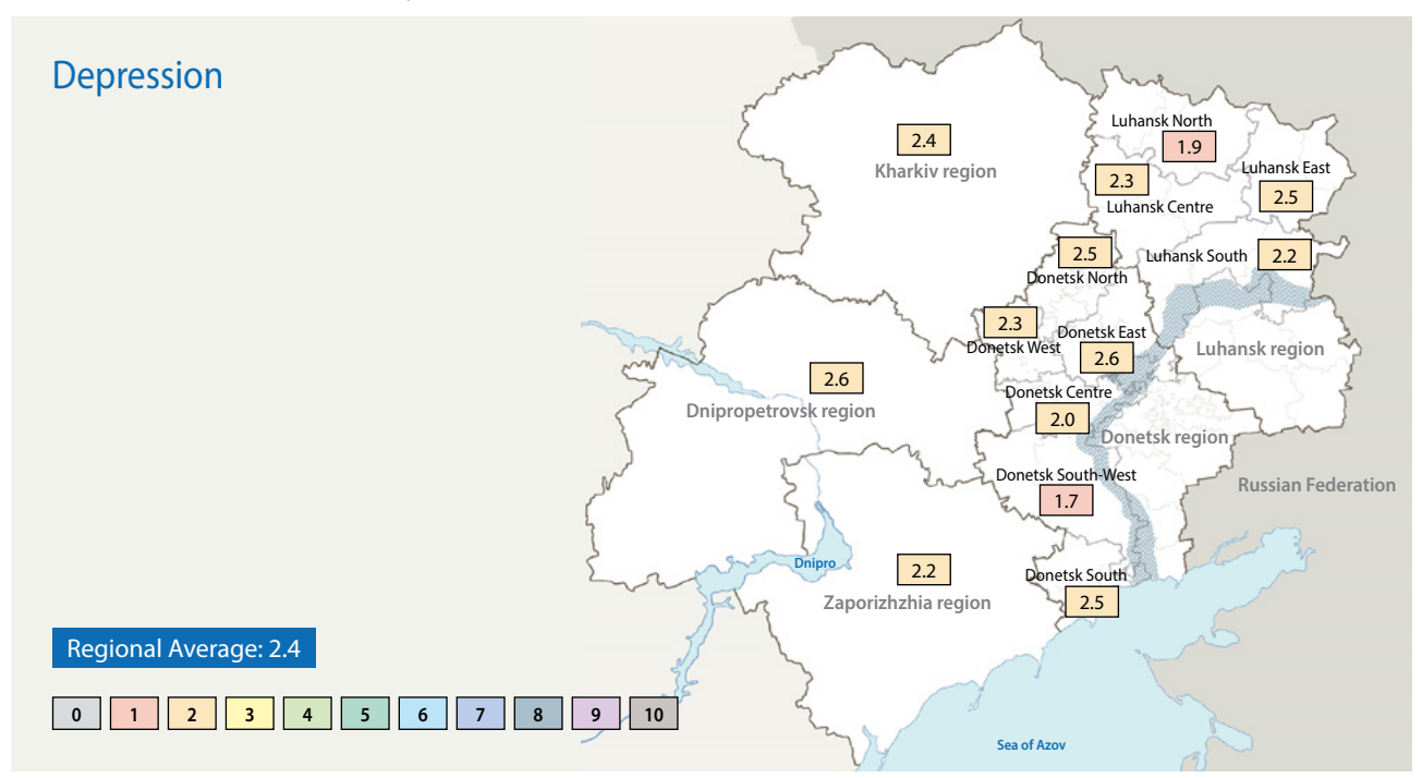
Figure 6: Scores for depression

With regards to depression, highest scores are once again found in Dnipropetrovsk oblast and eastern Luhansk oblast, but also in eastern Donetsk oblast. However, unlike anxiety, a demographic breakdown shows that rather than age and gender, income is most related to depression. In other words, as the level of income decreases, tendency for depression tends to increase.