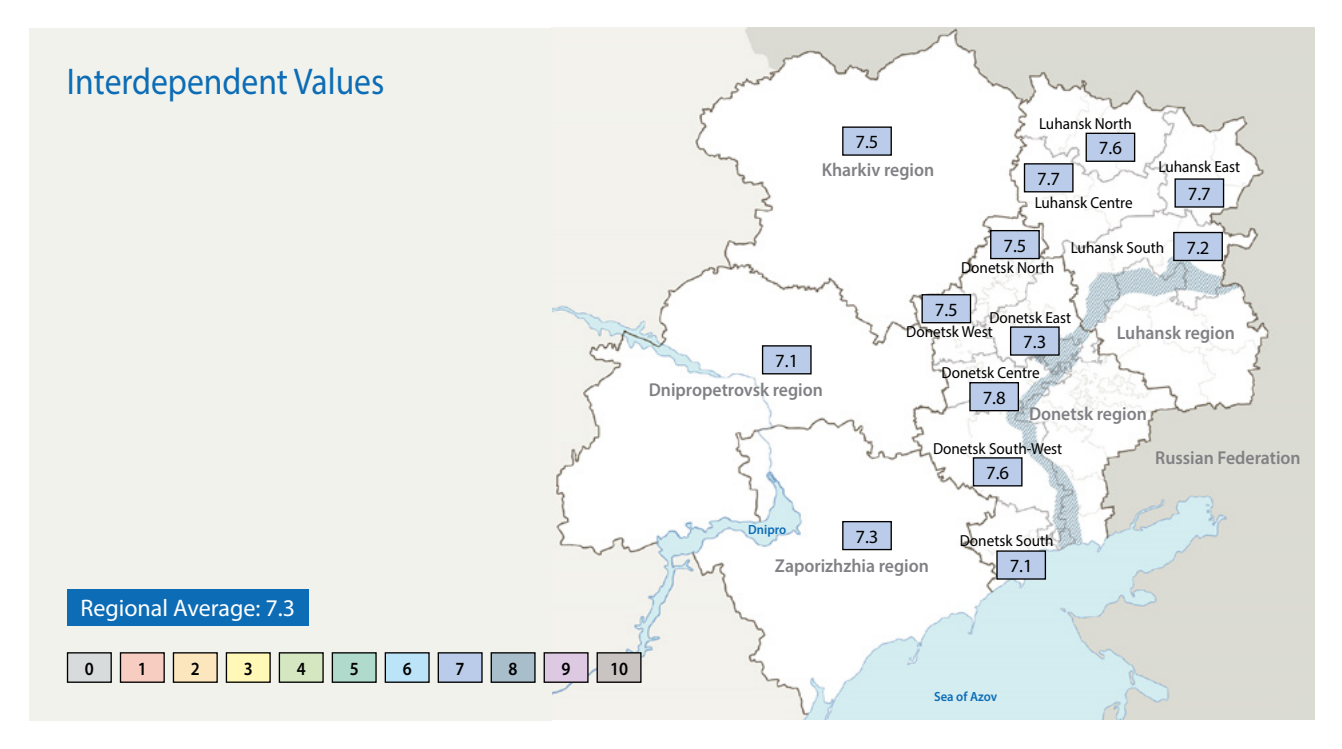
Figure 8: Scores for interdependent values

The average score for interdependent values (which has the strongest positive impact on adaptive psychosocial functioning) is 7.3 (Figure 8), where 0 indicates that nobody in society shares interdependent values, and 10 means that everyone in society shares a strong sense of interdependent values. The analysis suggests that people who exhibit strong interdependent values are more likely to have more resilient coping mechanisms. The scores for interdependent values are similarly strong across the east of Ukraine, with central Donetsk oblast and central and eastern Luhansk oblast showing higher scores while Dnipropetrovsk oblast, where scores for anxiety and depression are high, shows the lowest score. A demographic breakdown of this indicator also reveals that women and older people play a significant role in upholding interdependent values.