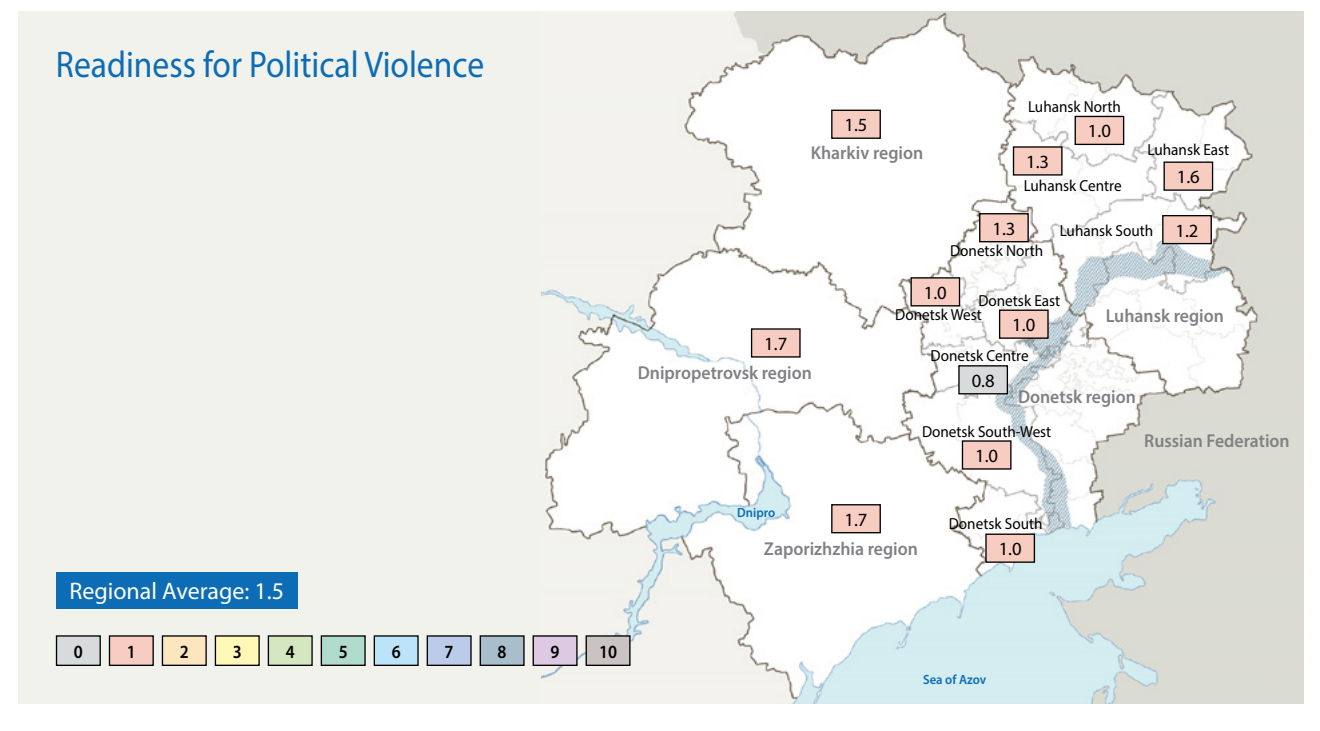
Figure 10: Scores for readiness for political violence

The average score for readiness for political violence (negatively impacting on adaptive psychosocial function) is 1.5 (Figure 10), where 0 means that nobody is ready to use violent means to achieve political change, 10 means that most if not all people express extreme tendencies to do so. Eliminating violence and orientations toward violence is difficult if not impossible, especially in a society that is experiencing conflict. All things considered, this low score is relatively promising, but still requires remedial actions. The highest scores for readiness for political violence are found in Dnipropetrovsk, Kharkiv and Zaporizhzhia oblasts, but also in eastern Luhansk oblast. A more in-depth analysis of the readiness for political violence can be found under Outcome 4: tolerant and socially responsible citizenship.