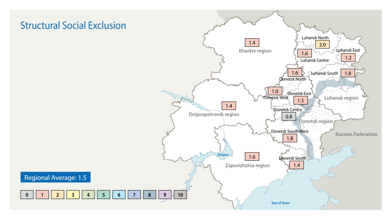
Figure 11: Scores for structural social exclusion

Structural social exclusion with an average score of 1.5 is among the significant indicators negatively impacting on adaptive psychosocial function (Figure 11), where 0 means that nobody feels isolated or marginalized because of their position in society, and 10 means that most if not everyone feels isolated or marginalized in one way or another. While a higher score can be observed in southern Luhansk oblast (2.0), central Donetsk oblast scores lower than the regional average.