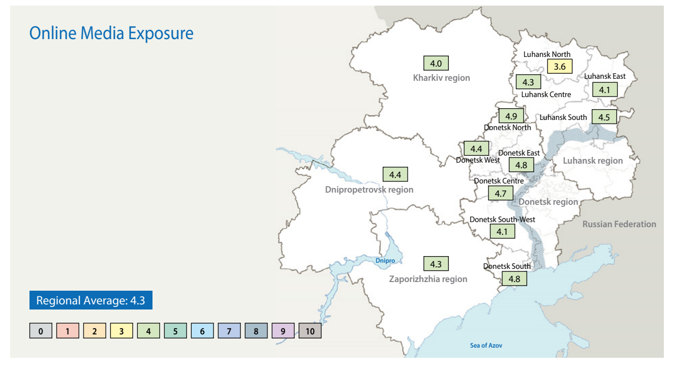
Figure 12: Scores for online media exposure

The average score for online media exposure (positively impacting on adaptive psychosocial function) is 4.3 (Figure 12), where 0 means that no one makes use of online sources to stay informed about current events, 10 means that most if not all make use of online sources to stay informed about current events. Northern, eastern and central Donetsk show the highest scores for online media exposure, while north Luhansk shows the lowest score.