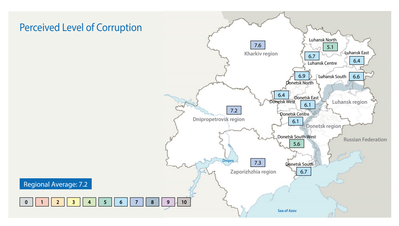
Figure 13: Scores for perceived level of corruption

Lastly, the average score for perceived level of corruption (negatively impacting on adaptive psychosocial function) is 7.2 (Figure 12), where 0 means that no one thinks that there is corruption in the form of receiving informal payments, 10 means that most if not all think that this happens very frequently. Although the perceived level of corruption is high across the region, highest scores can be observed in Kharkiv, Dnipropetrovsk and Zaporizhzhia oblasts, while the lowest score is in northern Luhansk oblast.