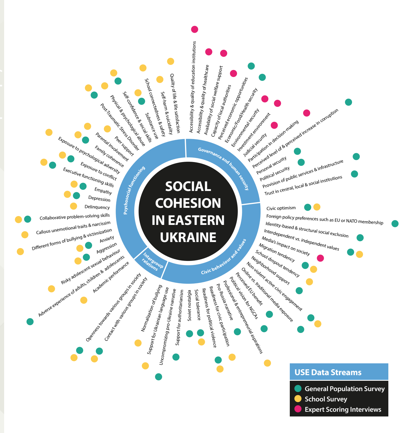
Figure 1. Conceptual model for social cohesion in eastern Ukraine