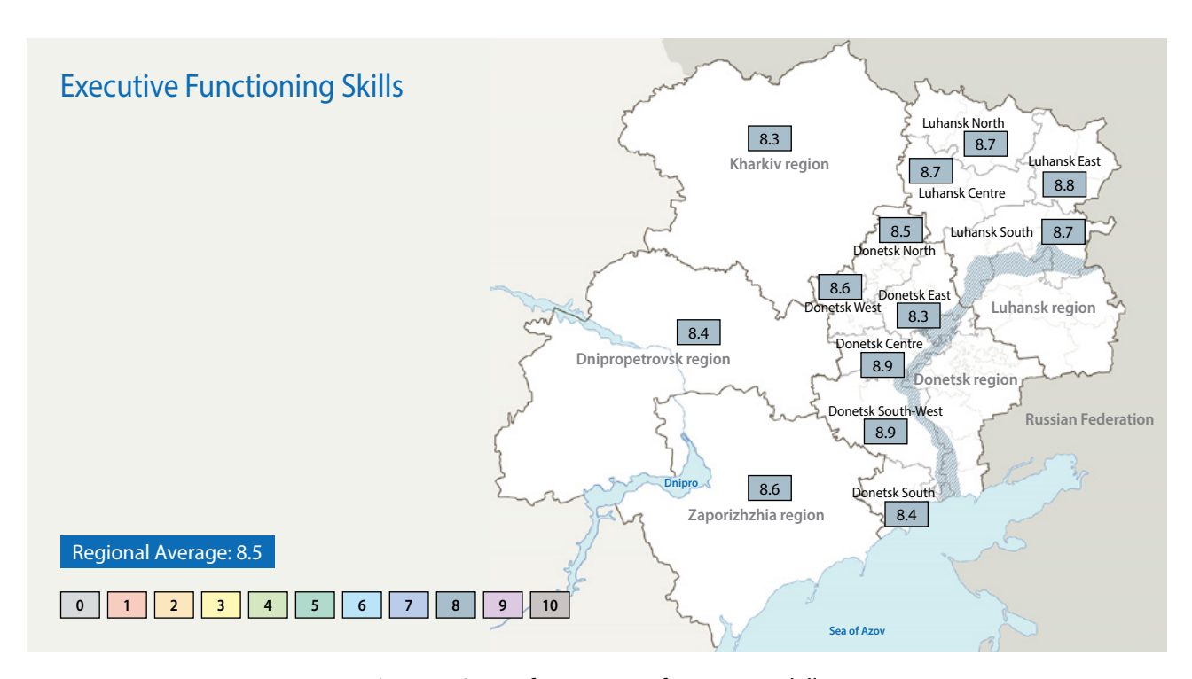
Figure 4: Scores for executive functioning skills

In terms of weaknesses, however, the scores for anxiety (Figure 5) and depression (Figure 6) deserve attention.<sup>3</sup> With regards to anxiety, Dnipropetrovsk oblast has a higher score than many of the clusters of raions directly bordering the conflict area, with the exception of eastern Luhansk oblast. One possible explanation may be that people who live in close proximity to the contact line have developed strong coping mechanisms for dealing with the hardships and insecurities that have become "a way of life" in recent years. Moreover, women have significantly higher levels of anxiety. Levels of anxiety also significantly increase with age, meaning that older people feel stronger anxiety compared to younger people. The data shows that people with higher levels of education and income tend to have lower levels of anxiety, with a similar tendency with regard to employment (i.e., employed people are likely to have less anxiety than those who stay at home, e.g., unemployed, retired, maternity leave, etc.).