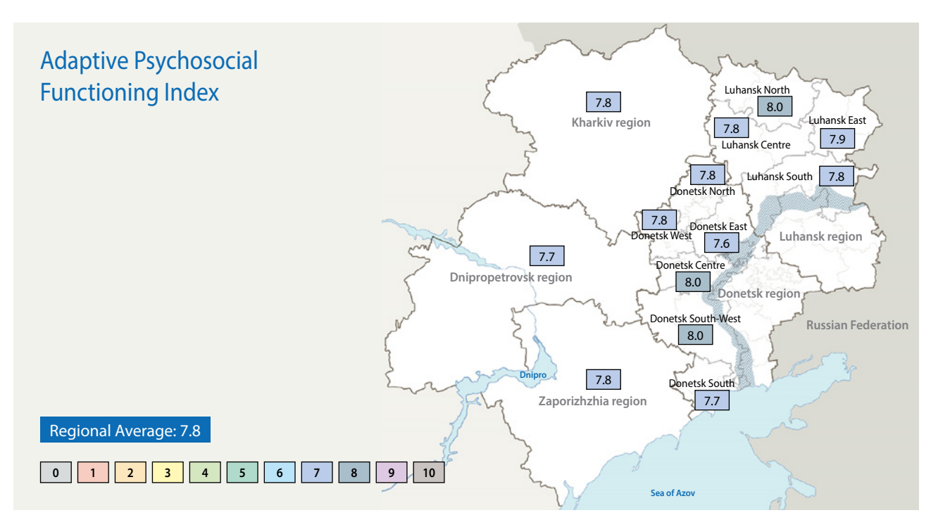
Figure 2: Scores for adaptive psychosocial functioning